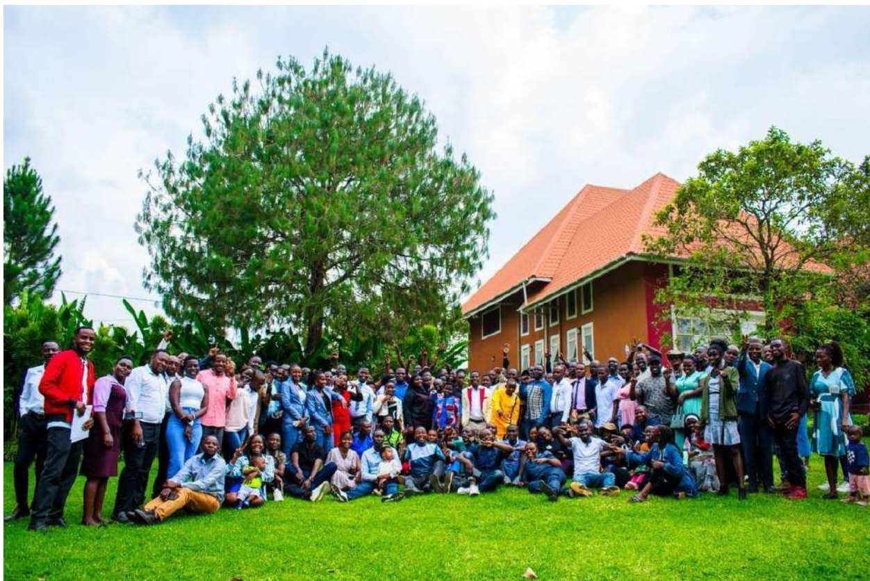
P4T Staff — Annual General Meeting & End-of-Year Party, Kabalega Resort Hotel, Hoima City