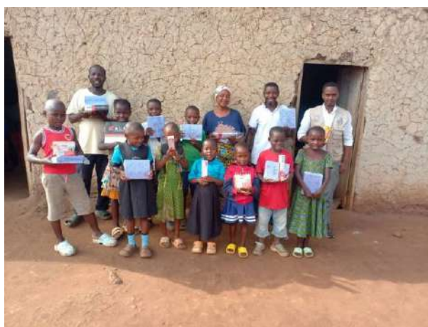
WISK beneficiaries — New Hope Nursery & Primary School