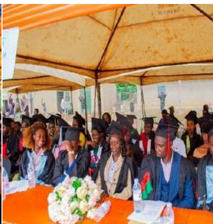
VST Graduation 2025