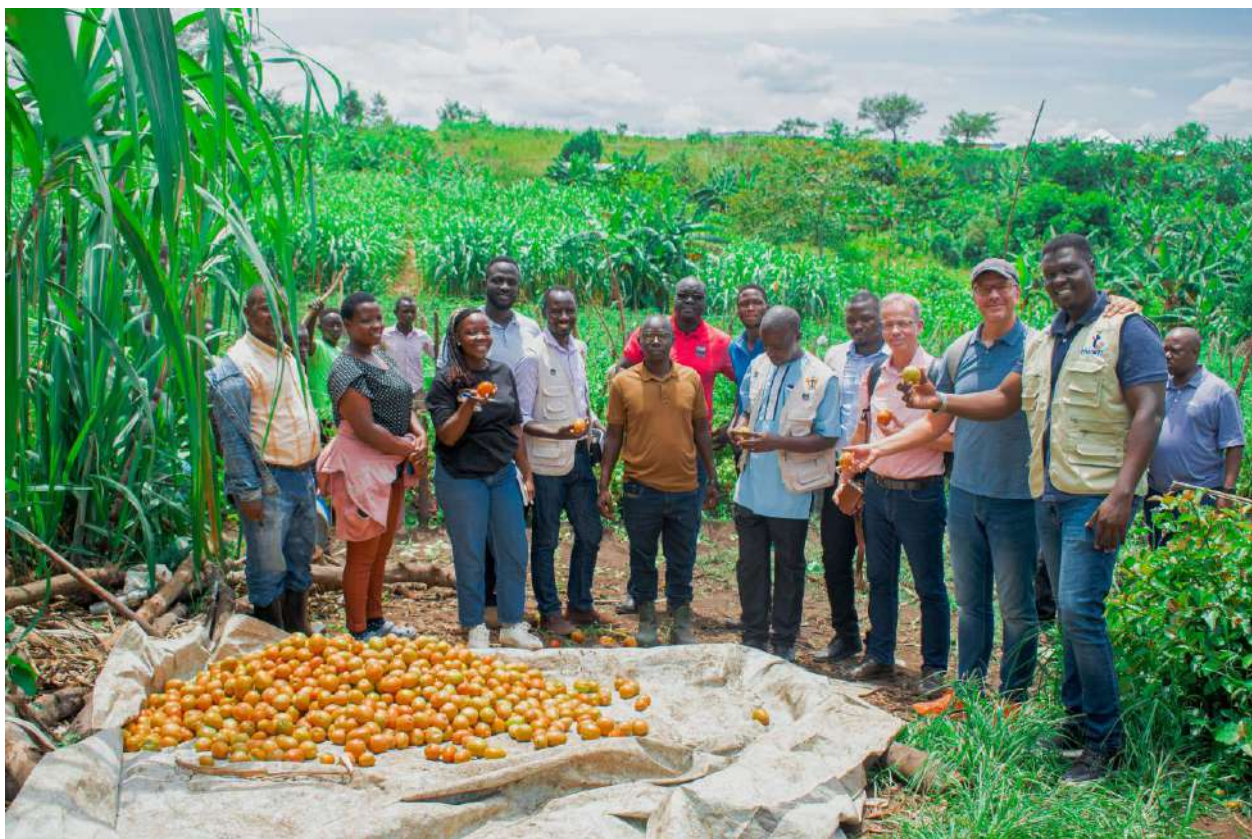
AGILE Team visiting a modal farmer — learning and feasibility study tour