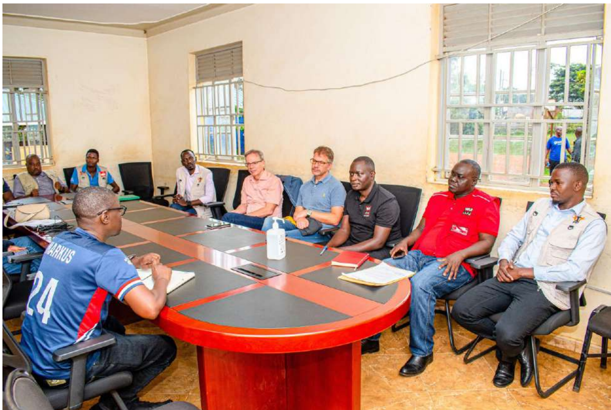
P4T Senior Management engaged in discussion with OPM — Kyangwali Refugee Settlement, AGILE Project coordination