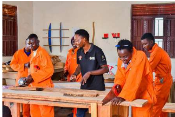
Carpentry & Joinery — VST Centre