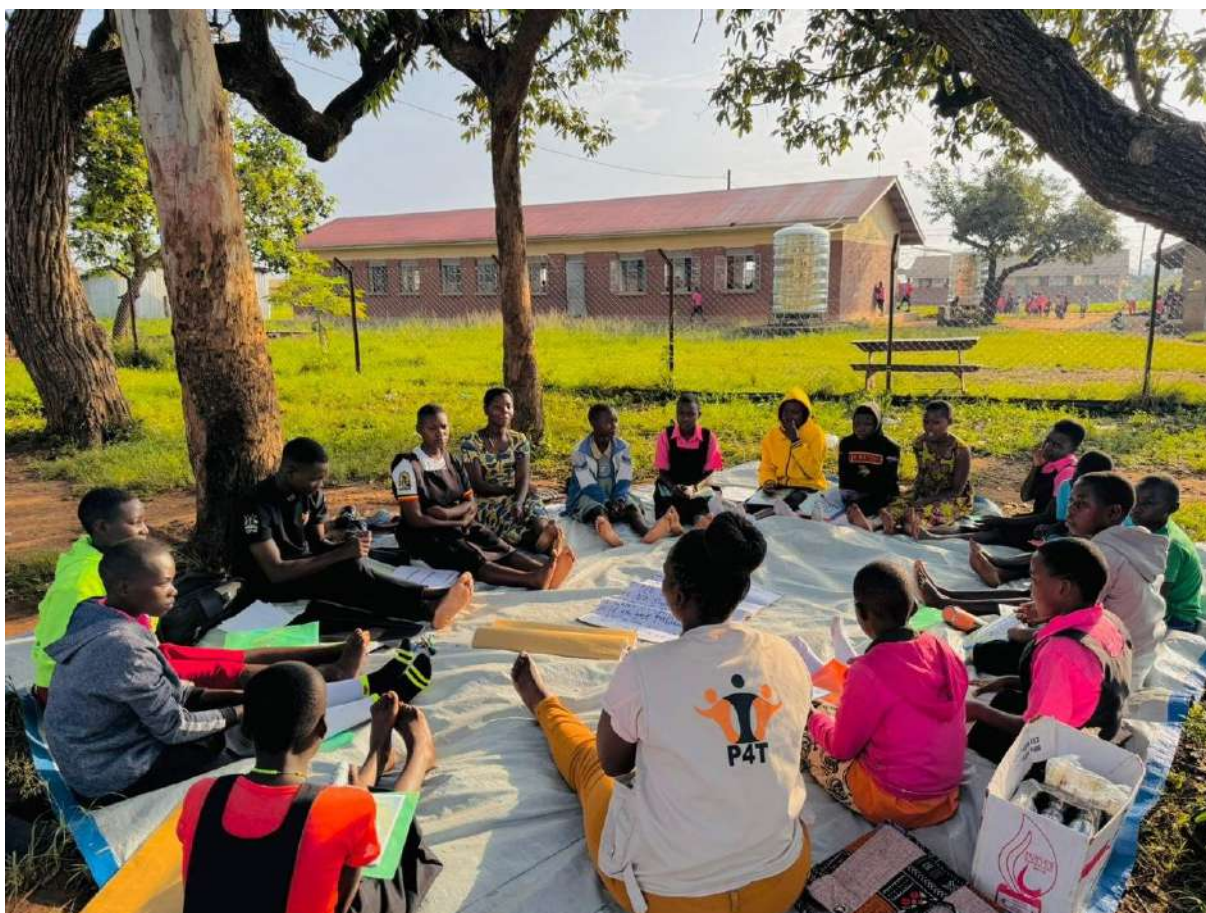
EASE Adolescents session in progress at Wairagaza Primary School