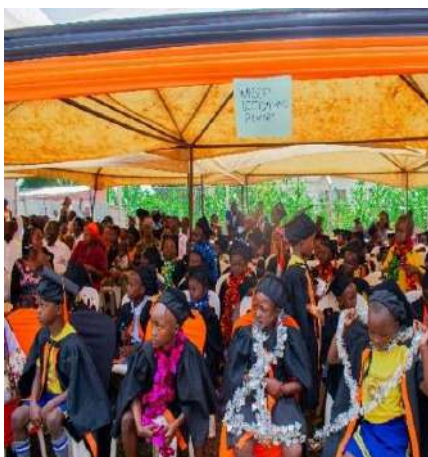
P4T ECD Graduands 2025