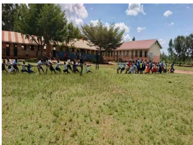
Team up Sessions at Kisaru P/S and Karuhinda Primary School