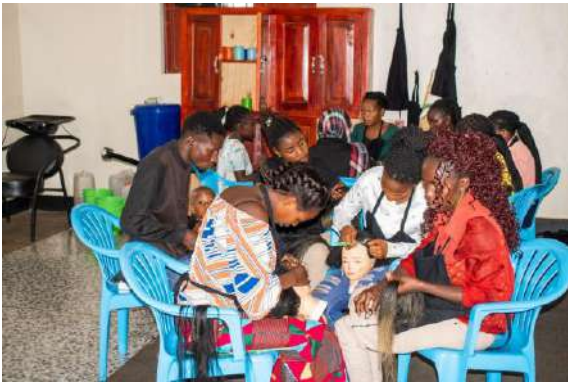
Hairdressing class — VST Centre

The centre currently offers UVTAB modular training and certification in 7 trades: Carpentry, Tailoring, hair Dressing, Multimedia, Soap Making, Horticulture, and Phone Repair. Trainings started in December 2024, and so far 138 youth have graduated from the centre in different disciplines.