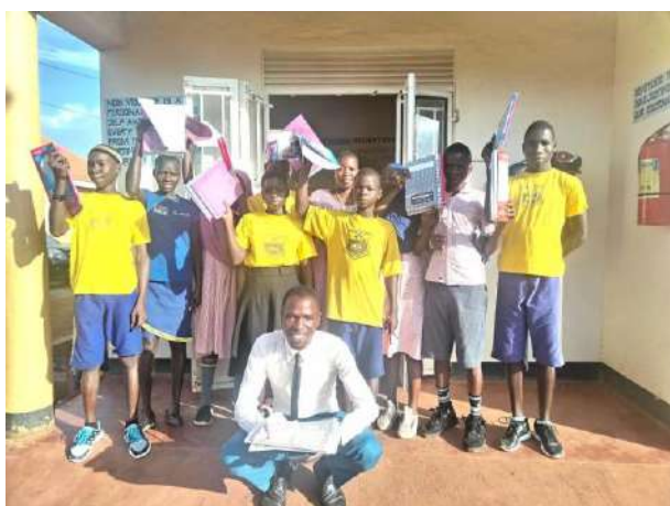
WISK beneficiaries — P4T Nursery & Primary School

The Integrated Well-being for School Children in Kyangwali (WISK) project strengthened psychosocial wellbeing and school participation of vulnerable children through talk therapy, scholastic materials support, and home visits.