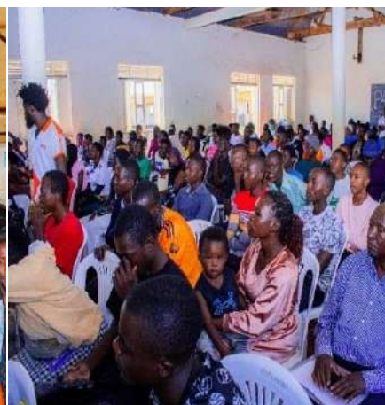
Career Guidance & Counselling — S.4 Leavers