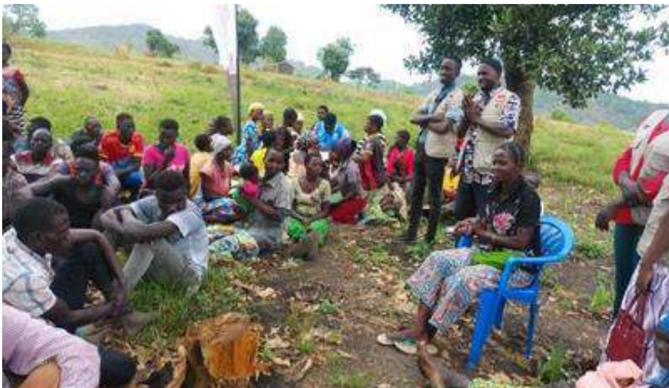
Protection Session in Bukinda Community in Kyangwali Refugee Settlement

Co-implemented with the Norwegian Refugee Council (NRC), the ICLA project supported refugees in obtaining civil and identity documentation necessary to access their rights and essential services.